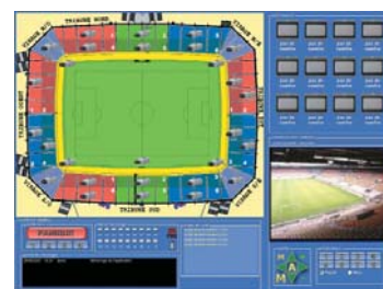
Example of custom user interface